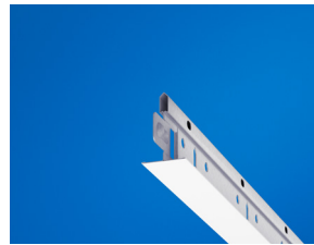
Connect T24 Main Runner C3

The body of Connect T24 Main Runner C3 and Connect T24 Cross Tee C3 is special treated steel with high corrosion resistance, and it's capped with galvanized and coated steel. Connect C3 grid has a self-repairing protection on cut edges. Ecophon also offer different trims and accessories in corrosion class C3.